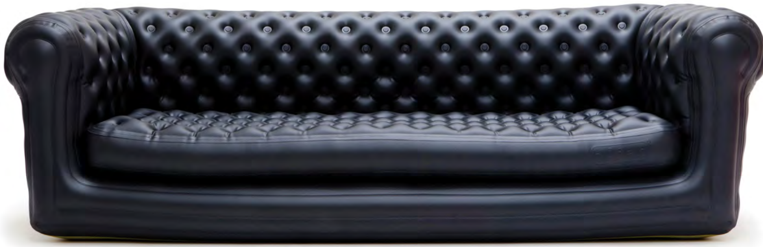
Sofa W 94" x H 30" x D 40", 62 lbs