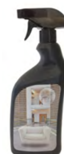
Cleaner So when your CHESTER is dirty you can clean it. Available in two sizes: SM 25 FL OZ (750mL) LG 3.2 GAL (12L)