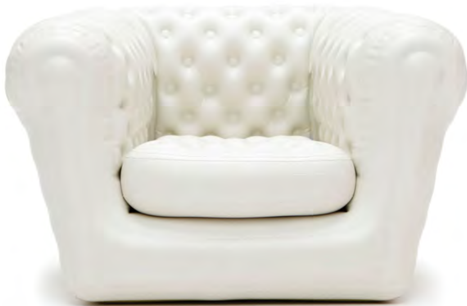
Armchair W 47" x H 30" x D 42", 37 lbs