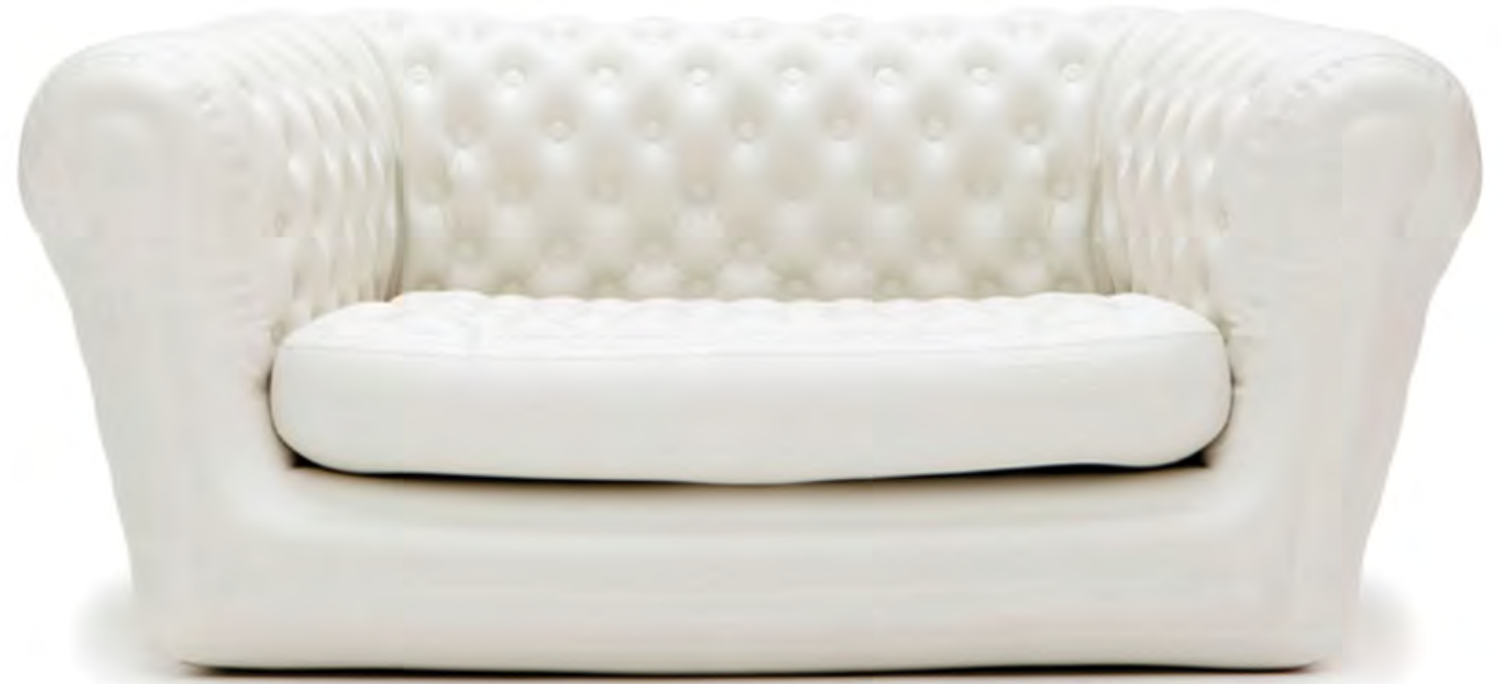
Loveseat W 67" x H 30" x D 42", 48 lbs