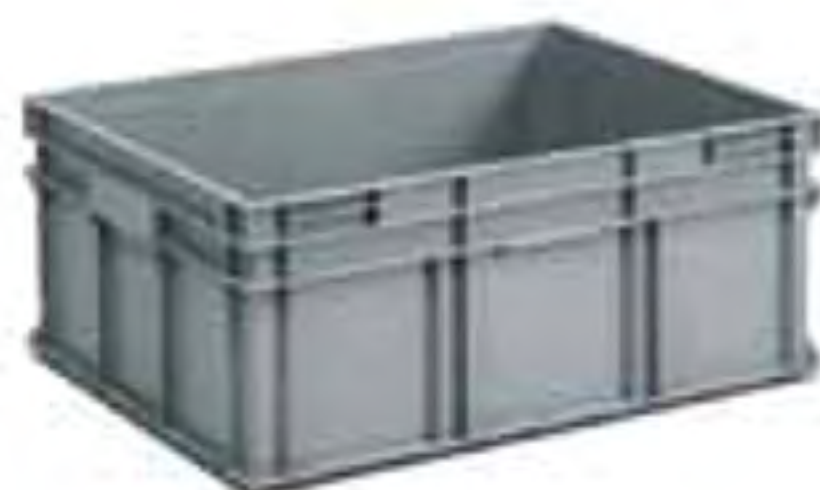
Crate Heavy duty plastic storage container, stackable, for CHESTER armchair or loveseat