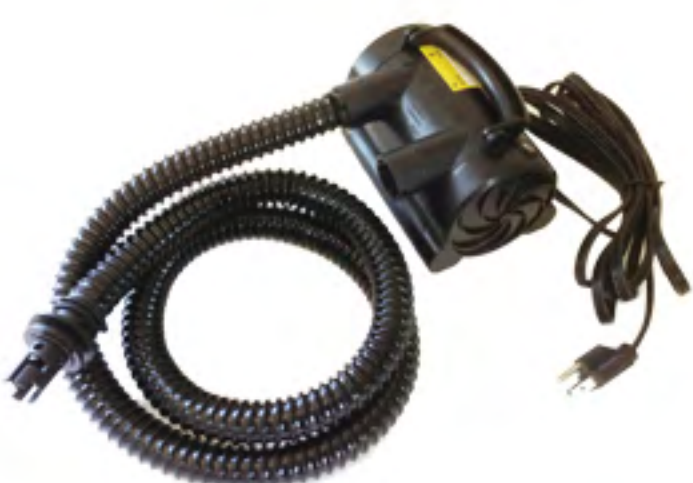
Air Pump Required to fill your CHESTER